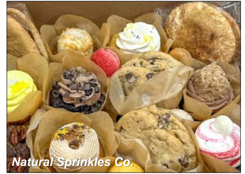
Natural Sprinkles Co.

Bodhi Bakery is open Tuesday-Friday 8 am-3 pm and Saturday 8 am-1pm.