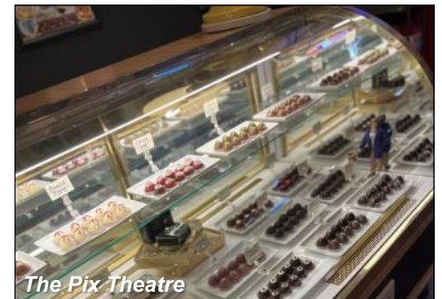
The Pix Theatre

Natural Sprinkles is open Monday-Saturday 9 am-5 pm.