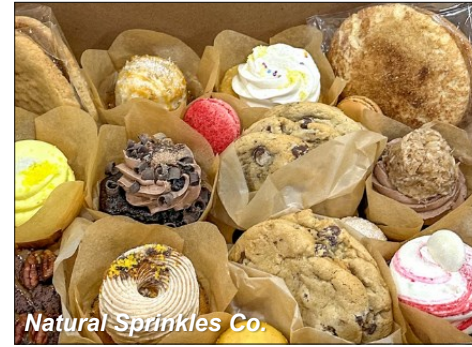
Natural Sprinkles Co.

Bodhi Bakery is open Tuesday-Friday 8 am-3 pm and Saturday 8 am-1pm.