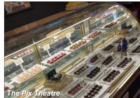
The Pix Theatre

Natural Sprinkles is open Monday-Saturday 9 am-5 pm.