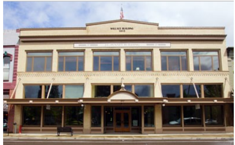
J.C. Penney Building, Renovated 2009 - 2010 using $700,000 from the city's Urban Renewal District.