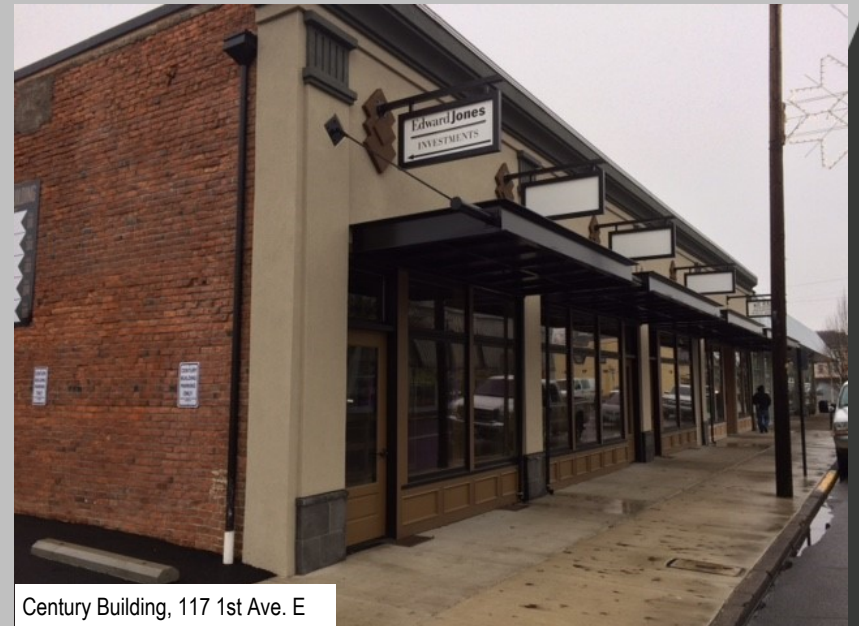
Century Building, 117 1st Ave. E

For businesses wanting to locate in the Historic Downtown District, the Albany Downtown Association is here to help. Our team is familiar with current inventory and prior uses of most Downtown spaces. Downtown properties available for lease and for sale are listed on our website under "Spaces". A free, confidential City of Albany Pre-application Meeting is recommended before signing a contract (see Section 3).