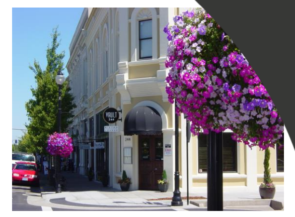
Vault 244 and Summer Flower Baskets