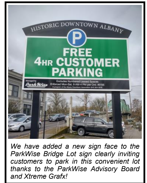
We have added a new sign face to the ParkWise Bridge Lot sign clearly inviting customers to park in this convenient lot thanks to the ParkWise Advisory Board and Xtreme GrafX!

Thank you to the committee for their hard work in reviewing pre-applications and determining the best way to serve our Downtown. The next step is to complete the statewide grant applications. This will rely heavily on the partner building owners with the support of the committee and ADA staff.