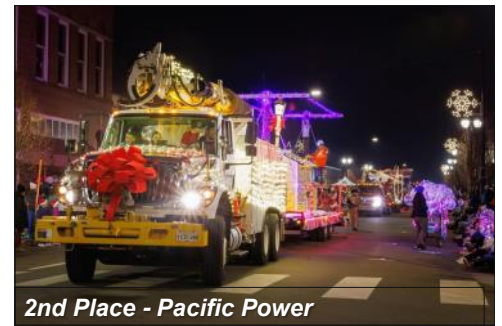
2nd Place - Pacific Power