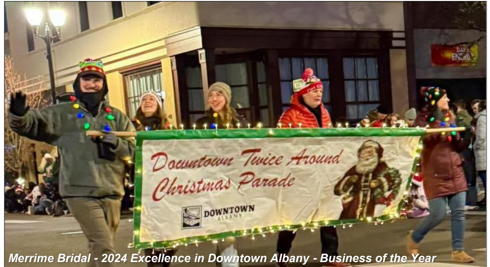
Merrime Bridal - 2024 Excellence in Downtown Albany - Business of the Year