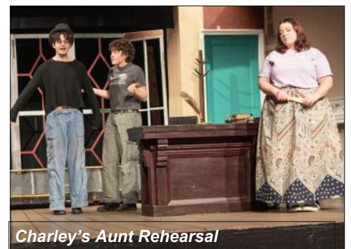
Charley's Aunt Rehearsal

17, 18, 19(m), 23, 24, 25. Evening performances start at 7:30 pm. The matinee begins at 2:30 pm. The theater is located at 111 1st Ave. W in Historic Downtown Albany.