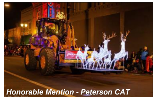
Honorable Mention - Peterson CAT