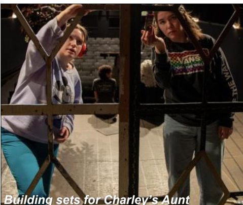
Building sets for Charley's Aunt