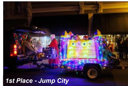
1st Place - Jump City