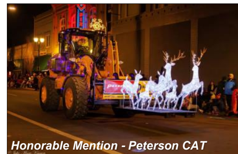
Honorable Mention - Peterson CAT