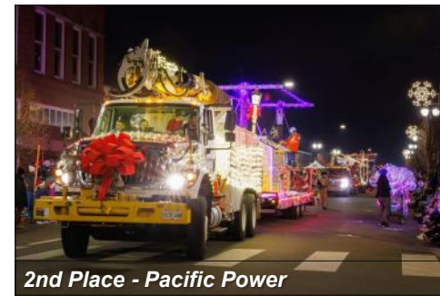
2nd Place - Pacific Power