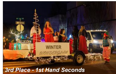
3rd Place - 1st Hand Seconds