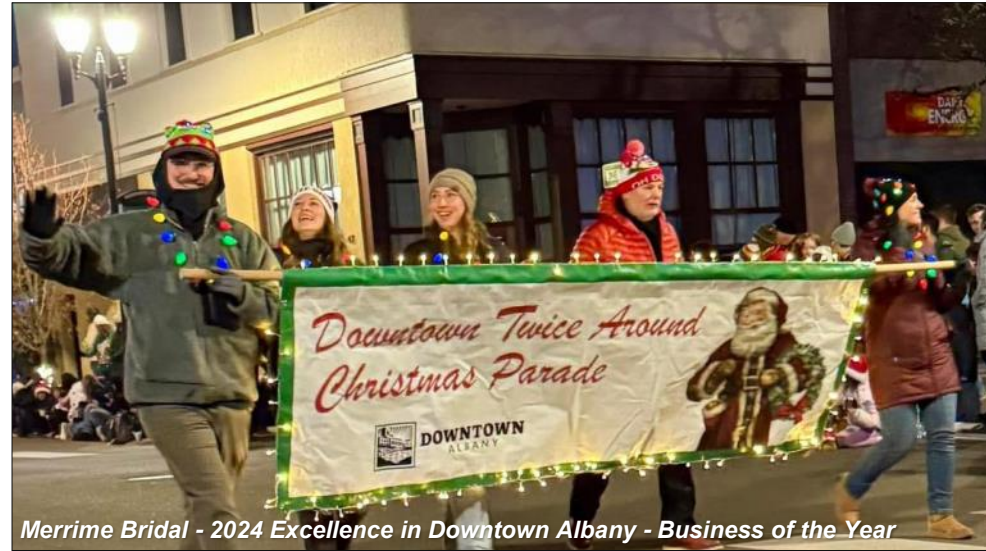
Merrime Bridal - 2024 Excellence in Downtown Albany - Business of the Year