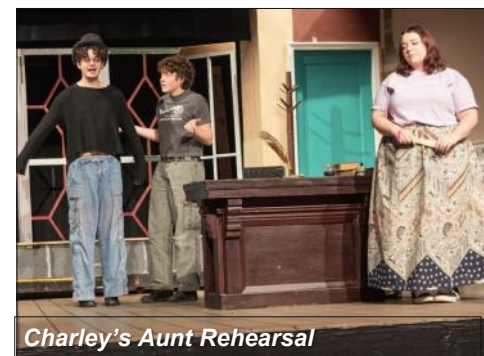
Charley's Aunt Rehearsal

17, 18, 19(m), 23, 24, 25. Evening performances start at 7:30 pm. The matinee begins at 2:30 pm. The theater is located at 111 1st Ave. W in Historic Downtown Albany.