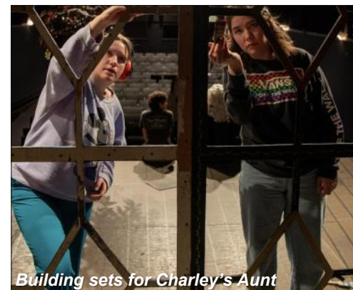
Building sets for Charley's Aunt

The play follows two Oxford students, Charley Wykeham and Jack Chesney, who need a chaperone to meet their