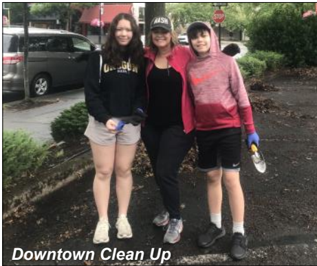
Downtown Clean Up

We are grateful for our committee members. ADA, like all Main Street organizations are based on Main