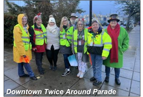
Downtown Twice Around Parade

ECONOMIC VITALITY: The Economic Vitality Committee works with building owners to find tenants, helps business-