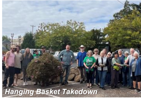
Hanging Basket Takedown

DESIGN: The Design Committee works tirelessly to make Downtown Albany welcoming and enjoyable. Throughout the year, they lead initiatives that beautify our streetscape. This includes organizing Downtown