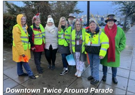
Downtown Twice Around Parade

ECONOMIC VITALITY: The Economic Vitality Committee works with building owners to find tenants, helps business-