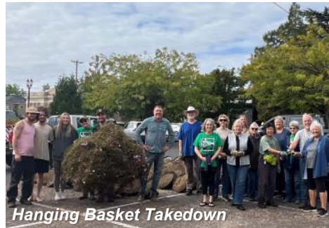
Hanging Basket Takedown

DESIGN: The Design Committee works tirelessly to make Downtown Albany welcoming and enjoyable. Throughout the year, they lead initiatives that beautify our streetscape. This includes organizing Downtown