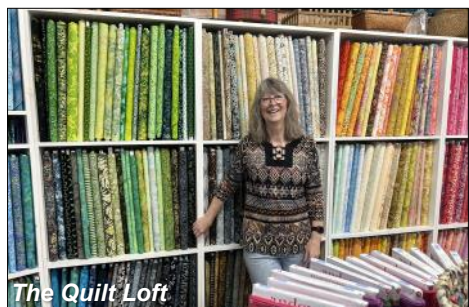
The Quilt Loft

Quilting is a pastime with hundreds of years of history, yet techniques and fabric selections also make it fun and new.