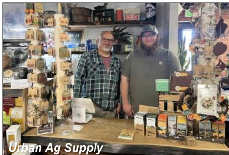
Urban Ag Supply

Cooking and food are popular pastimes. Urban Ag Supply stocks a nice