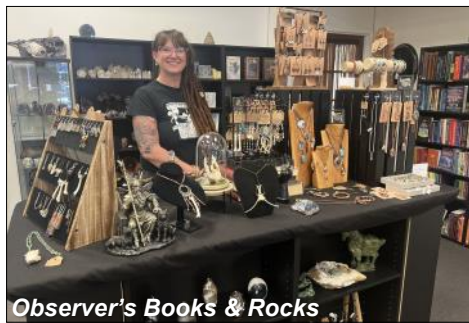
Observer's Books & Rocks

For both aspiring artists and seasoned professionals, The Frame House offers a nice selection of art supplies, including watercolor and oil paints, brushes and paper.