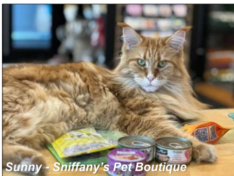
Sunny - Sniffany's Pet Boutique

Enjoying time with furry friends is a favorite pastime of many people. Sniffany's Pet Boutique offers everything your dog or cat may need for a fun, healthy life. They stock a wide variety of food, treats and collars.