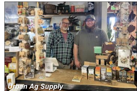
Urban Ag Supply

Cooking and food are popular pastimes. Urban Ag Supply stocks a nice