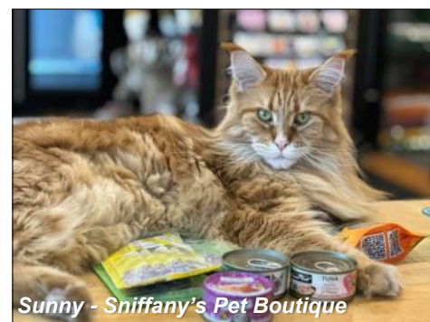
Sunny - Sniffany's Pet Boutique

Enjoying time with furry friends is a favorite pastime of many people. Sniffany's Pet Boutique offers everything your dog or cat may need for a fun, healthy life. They stock a wide variety of food, treats and collars.