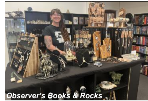
Observer's Books & Rocks

For both aspiring artists and seasoned professionals, The Frame House offers a nice selection of art supplies, including watercolor and oil paints, brushes and paper.