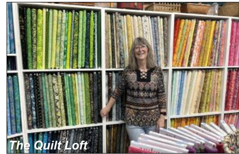
The Quilt Loft

Quilting is a pastime with hundreds of years of history, yet techniques and fabric selections also make it fun and new.