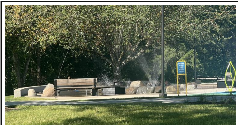
Monteith Riverpark, featuring an amazing stage, fun playground and refreshing splash pad, will officially open on Thursday, July 4th for the first night of River Rhythms.

Attendees are encouraged to attend the Craft Brew Smackdown and enjoy dinner at one of our 25+ Downtown restaurants before the show.