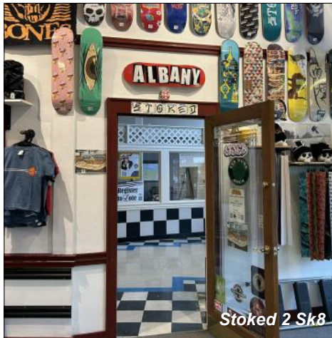
Stoked 2 Sk8

Take a whirl on Albany's hand crafted carousel and explore the carving and painting studios. Treat the family to ice cream and snacks at Carousel Café, and don't miss the Carousel Gift Shop for toys, puzzles, clothing and more.