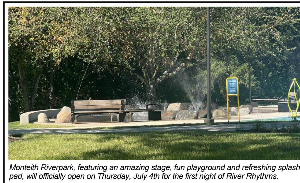
Monteith Riverpark, featuring an amazing stage, fun playground and refreshing splash pad, will officially open on Thursday, July 4th for the first night of River Rhythms.

Follow our "Movies at Monteith" and ADA Facebook pages and website for updates, www.albanydowntown.com .