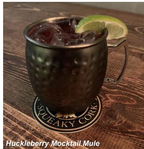
Huckleberry Mocktail Mule

The Squeaky Cork 136 1st Ave. W (541) 981-2140