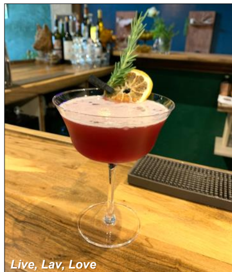
Live, Lav, Love

Greyhound Tavern 220 2nd Ave. SW (458) 253-4049