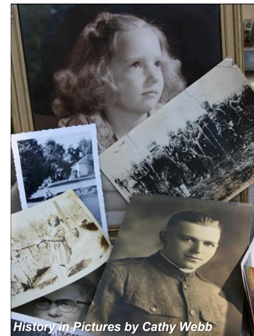
History in Pictures

May is National Preservation Month, a time to celebrate our love for history with exciting events that are happening Downtown. Our partners at the Albany Visitor's Association (AVA) have curated a list of some of their favorite events to help you get started. However, you can find many more on their calendar and in their National Preservation Month brochure.