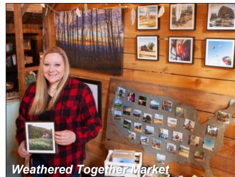
Weathered Together Market

Sunday, May 12 - 503 1st Ave. W Moms are what makes the world go round - and the ones who stand by us on our first carousel rides. On Mother's Day, Albany Carousel is offering free rides to all mothers as well as a carnation for the first 100 moms to walk through to doors!