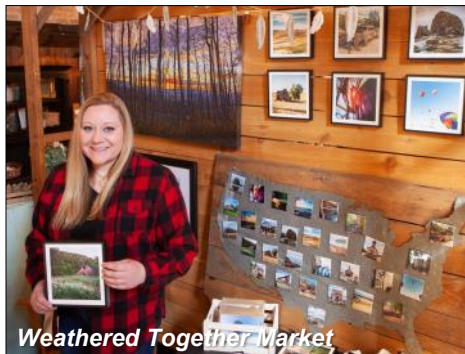
Weathered Together Market

Sunday, May 12 - 503 1st Ave. W Moms are what makes the world go round - and the ones who stand by us on our first carousel rides. On Mother's Day, Albany Carousel is offering free rides to all mothers as well as a carnation for the first 100 moms to walk through to doors!