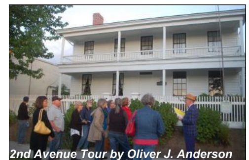
2nd Avenue Tour

Don your finest tweed attire and take a bicycle tour of Albany's National Historic Districts on Saturday, May 11. The ride starts at The Natty Dresser, 124 Broadalbin St. SW. Arrive by 9:30 am to enter the costume and best bike contests. The ride starts at 10 am.