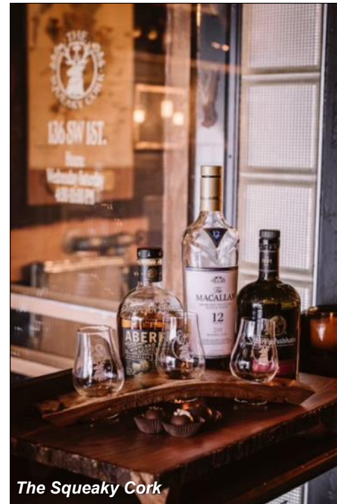
The Squeaky Cork