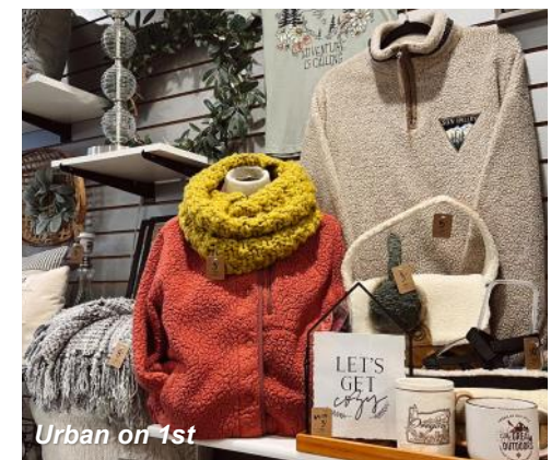
Urban on 1st

For more on these specials and dozens more, visit the ADA's and the individual businesses' social media pages.