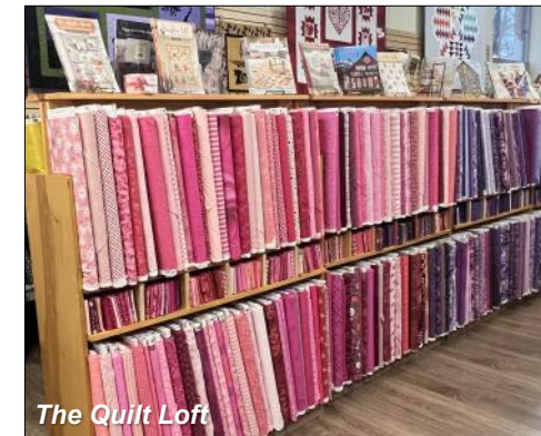
The Quilt Loft

Urban on 1st Clothing & Decor - Check out our Valentine's outfits, jewelry and gift certificates for loved ones.