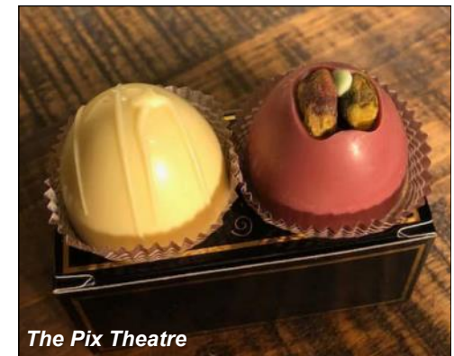
The Pix Theatre

For more information and to buy tickets visit, www.greateralbanyrotary.org