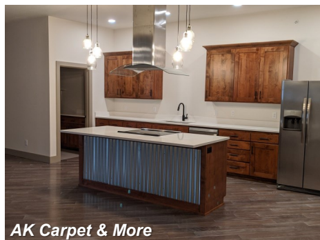
AK Carpet & More