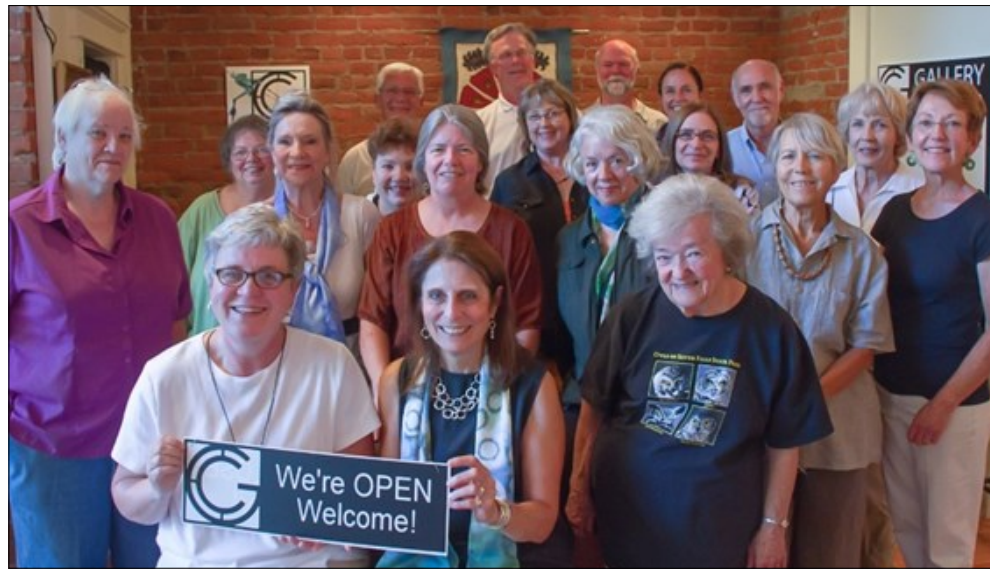
The 19 founding Members of Gallery Calapooia on opening day, 2013