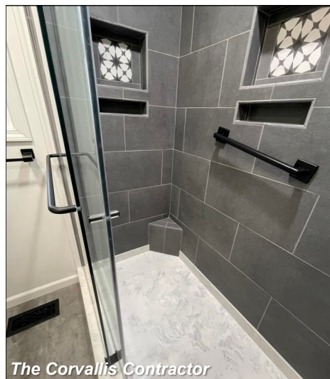
The Corvallis Contractor

"Since its founding, we have proudly served the local community by offering high quality and stylish window coverings