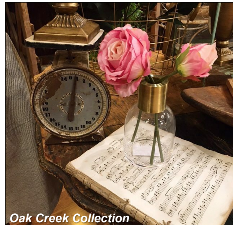
Oak Creek Collection

222 1st Ave. W #100 - (541) 971-5701 Local Artist Co-op, art, jewelry, cards, gifts