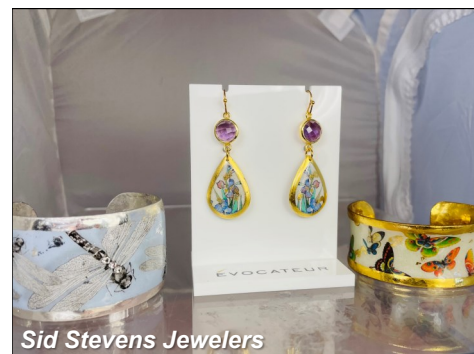
Sid Stevens Jewelers

Sunday, May 14 - 503 1st Ave. W Moms are what makes the world go round - and the ones who stand by us on our first carousel rides. On Mother's Day, Albany Carousel is offering free rides to all mothers as well as a carnation for the first 100 moms to walk through to doors!