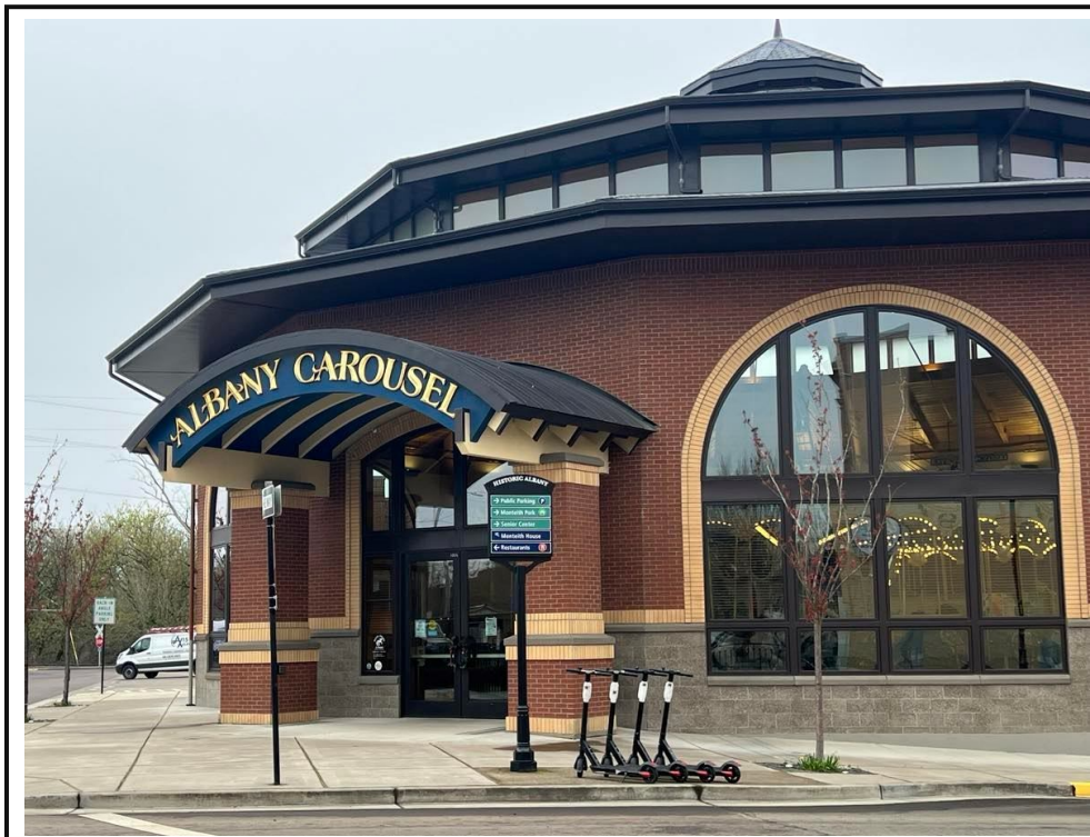
A sign of spring in Downtown Albany - the Birds are back!

Performances are May 12, 13, 14(m), 18, 19, 20. For info and tickets visit, www.albanycivic.org .