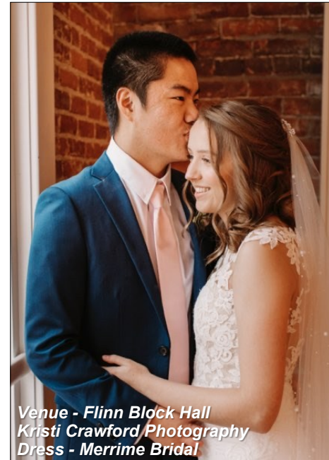
Venue - Flinn Block Hall Dress - Merrime Bridal

An inviting modern bridal boutique, Merrime Bridal offers gowns from exclusive and popular designers for brides of all styles and sizes. Round out the wedding party needs with bridesmaid gowns, mothers dresses, custom jackets, veils, accessories and gifts.