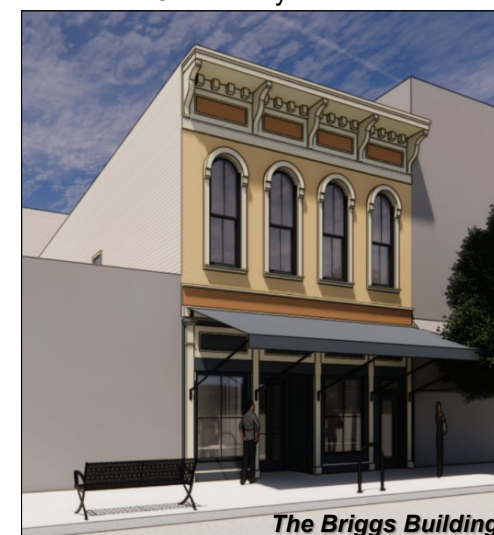
The Briggs Building

Albany Downtown Association plans to submit two applications for the OMS Revitalization Grant this year.