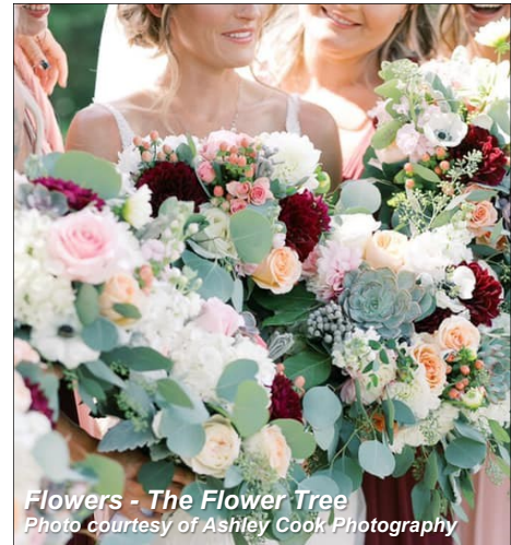
Flowers - The Flower Tree

Are you looking for the perfect venue? Flinn Block Hall is a beautiful historic ballroom with a romantic atmosphere,