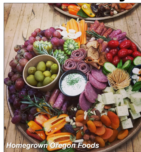
Homegrown Oregon Foods

Reds Boutique - All you really need is love, but a little chocolate with something new and Red every now and