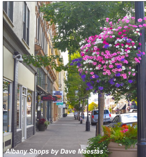
Albany Shops by Dave Maestas

The cost to enter is $2 per photograph with free entries for youth.