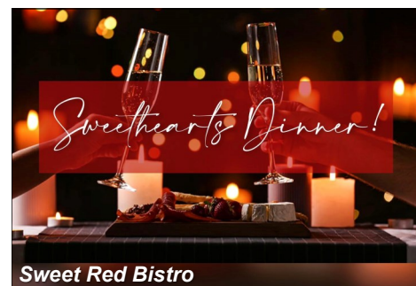
Sweet Red Bistro

Sweet Red Bistro - Join us to Celebrate Your Love with our Five Course Valentine's Dinner! Our Tantalizing Dinner for Two .... each course featuring delicious aphrodisiacs & guaranteed to please! We will also have a curated wine pairing available, as well as a romantic array of handcrafted Valentini Cocktails! For dinner, we will be featuring two seatings, 5 pm and 8 pm on both Valentine's Day and Feb. 15th!