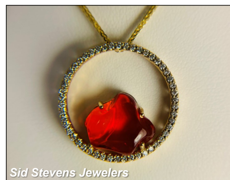
Sid Stevens Jewelers

City Delivery - The Oregon Challenge passport is available on our website, citydeliverservice.com, and also available at Margin Coffee. The Oregon Challenge is the perfect gift for your Oregon lover!