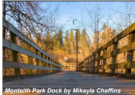
Monteith Park Dock